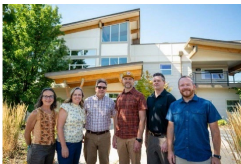
Sale of the Alturas Building to Northwest River Supplies (September 2022)

Please bring your ideas to CEDA staff, the CEDA Asset Management Committee, or to the CEDA Board of Directors.